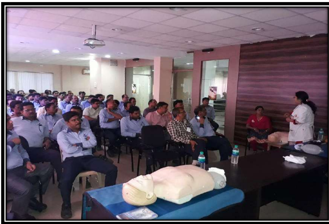
Free vocational CPR Training for Industry people