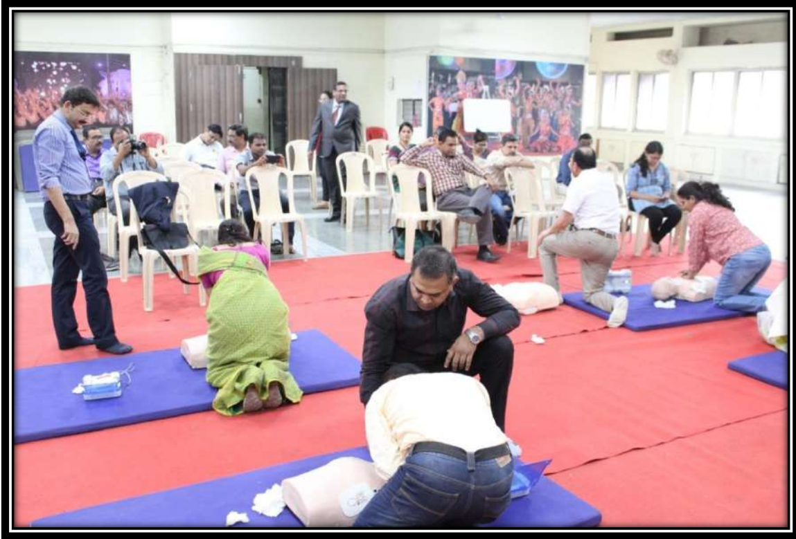
Free vocational CPR Training for Reporters